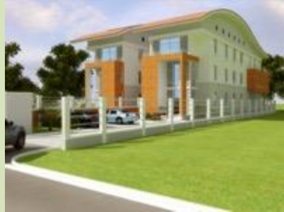
4 bedroom luxury Maisonette on 3 floors