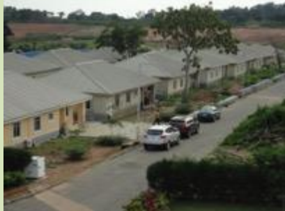
Aerial view, row of 3 bedroom bungalows