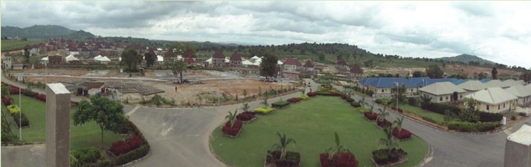
Wide angle shot showing well laid out streets and ongoing landscaping work