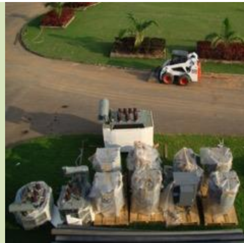
Electrical equipment awaiting installation