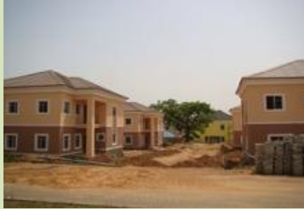
4 bedroom detached Maisonette + 2 bedroom BQ