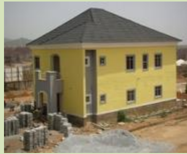
6 bedroom detached luxury Maisonette + 2 bedroom BQ