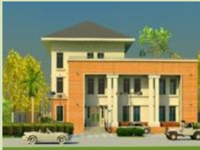
5 bed + Pent House with Swimming Pool. (when completed)