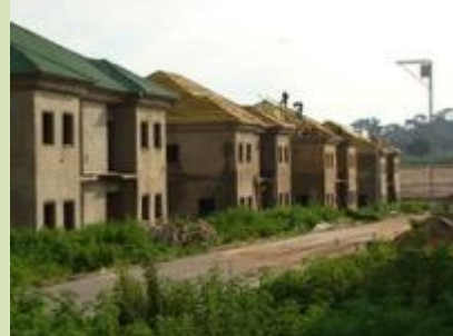
3 bedroom semi-detached house