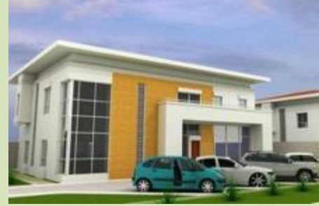
5 bedroom detached luxury Maisonette + BQ