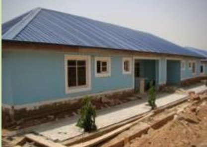
2 bedroom Semi-Detached Bungalow