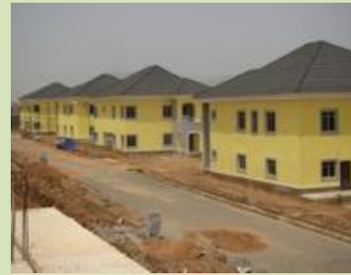
Row of 6 bedroom detached luxury Maisonette + 2 bedroom BQ