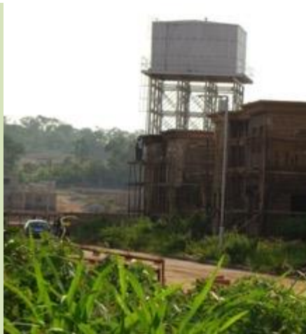
Overhead Water Tank Installation