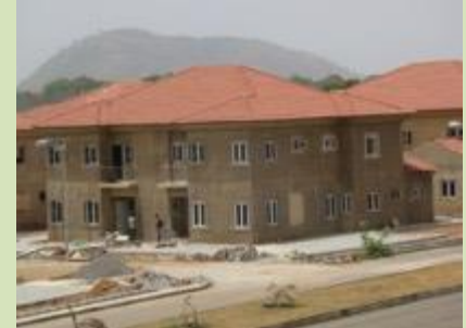
4 bedroom semi-detached house