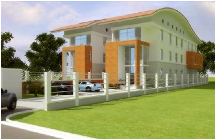
4 Bedroom Detached House @ Canaan Estate - Abuja

Since incorporation, we have carved out a niche for ourselves within the Nigerian real estate sector as developers of note, having completed several small to large scale real estate projects including the renowned Millennium Shelter Estate – Abuja. Currently, our efforts are concentrated on developing the Canaan Estate project also located in Abuja.