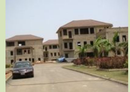
5 bed + Pent House with Swimming Pool.